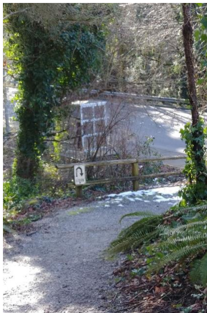
Park exit to Lakeway Drive, Bellingham, February 17, 2021.