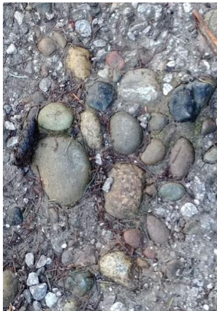
Close-up of the constellation of rocks, stones, and pine needles on the path into Whatcom Falls Park, February 17, 2021.