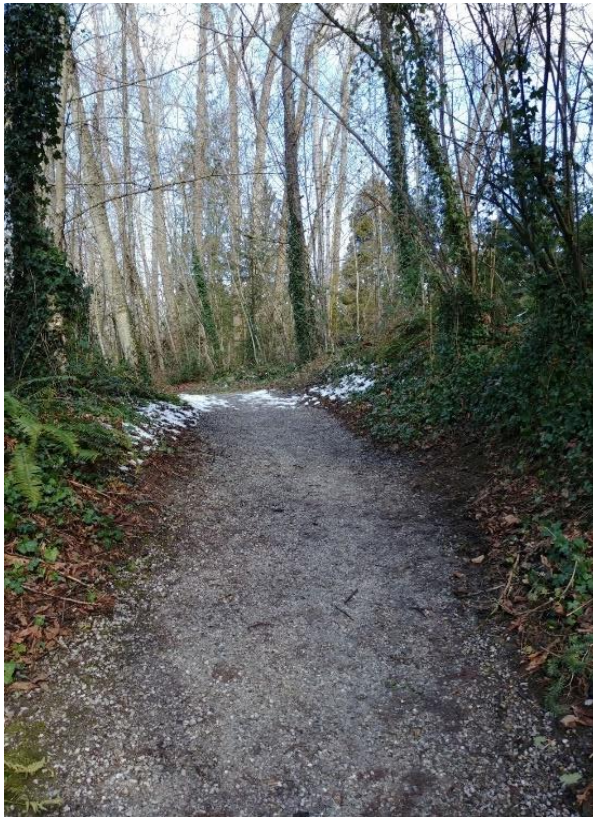
The path into Whatcom Falls Park, February 17, 2021.

1. Impermanence: “Guesting is by nature impermanent,” writes Hughes. “Guests are not resident owners. They come to a place already occupied, already owned. They come to a specific place, a place that existed prior to their arrival and prior to their needs as guests” (Hughes 2019, E-24). Escaping the roar of traffic on Lakeway Drive, the main road intersecting with the south entrance to the park, I begin my ascent up the gravel path to Whatcom Falls Park. I begin to tune my ear to the sound of the wind in the trees and the crunch of gravel under my feet as I walk in a moderate but steady rhythm. I think about the rocks that have occupied the earth for billions of years. They precede me and will proceed after me. I am impermanent, a mere snapshot in their time.