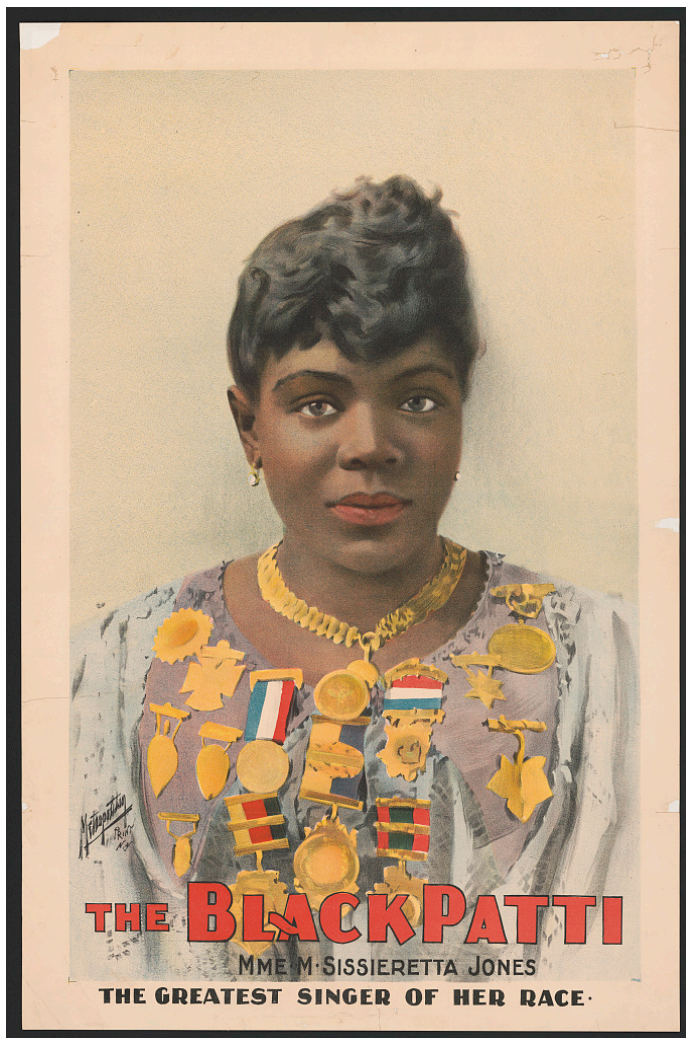
Metropolitan Printing Co. The Black Patti, Mme. M. Sissieretta Jones the greatest singer of her race. 1899. Photograph.