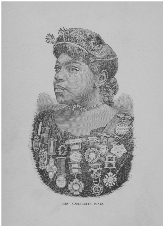
Mrs. Sissieretta Jones.

I have argued here that Sissieretta Jones's use of German performance reviews reveals strong articulations of her voice and demonstrates how Jones positions herself as a global subject whose textual self-construction was resistant to American racism. In her personal scrapbook, in particular, Jones took special care to collect reviews that mention her voice. The reviews she kept do not prevaricate on the nature of her vocal talent. An addendum to the scrapbook, written after her death, also in the Howard archives, is entitled, "Some Quotes from Her Personal Scrap Book about Her Voice" and contains the following: "if Madame Jones is not the equal of Patti, she at least can come nearer than anything the American public has heard. . . . Her notes are as clear as a mocking bird and her enunciation, perfect" (7). Quotes like these emphasize the importance of her achievement on an international level for Jones and the African American community writ large.